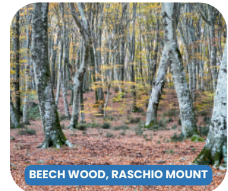
BEECH WOOD, RASCHIO MOUNT

e-Boats with dinner on the lake Foraging & cooking class Horse riding tour Yoga & meditation Hiking around the lake