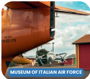
MUSEUM OF ITALIAN AIR FORCE