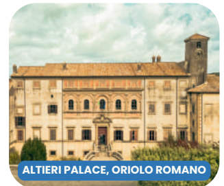
ALTIERI PALACE, ORIOLO ROMANO

Pottery experience Paint on boat Private guided tour Photography workshop Fabric painting