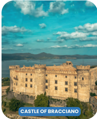
CASTLE OF BRACCIANO

Discover an unexpected land of castles, historical villages and palaces, ancient churches and Roman ruins. BELTUR – Lakes of Rome offers a unique experience away from the crowds, taking you on a journey through time. Explore the Roman complex built around the mineral water source of Acqua Claudia, the remains of Roman aqueducts and don't miss the iconic Bracciano Castle and the Historical Museum of the Italian Air Force.